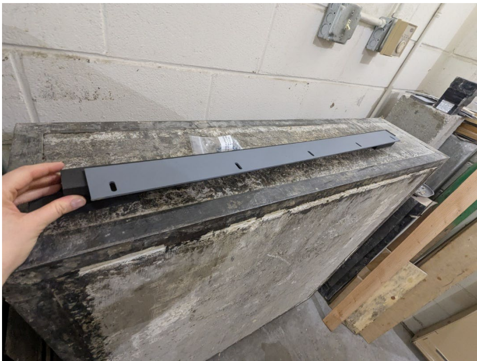
Figure 2 – Super H Door Bottom prior to installation