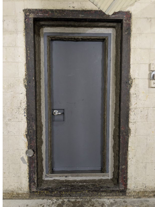
Figure 1 – Specimen mounted in test aperture, as viewed from source room (left) and receive room (right)