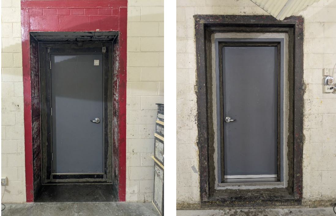
Figure 1 – Specimen mounted in test aperture, as viewed from source room (left) and receive room (right)