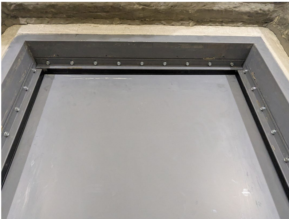
Figure 2 – Magnetic seal retainers and gaskets installed