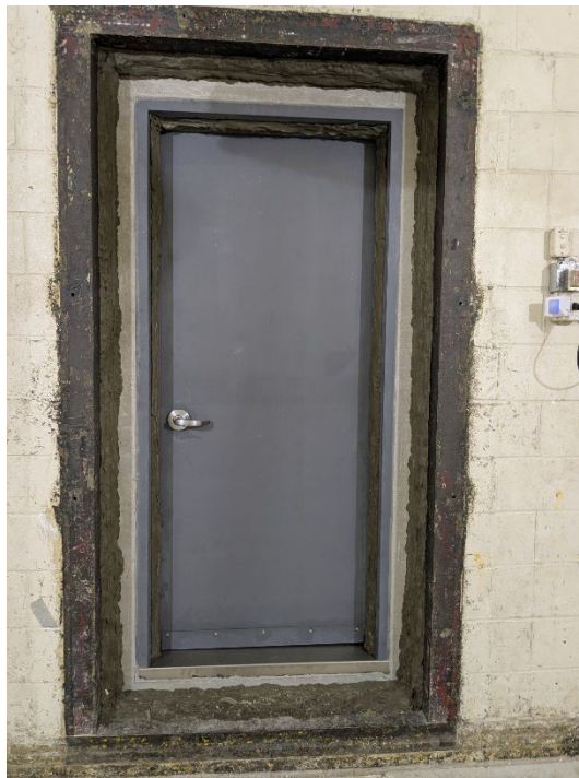
Figure 1 – Specimen mounted in test aperture, as viewed from source room (left) and receive room (right)