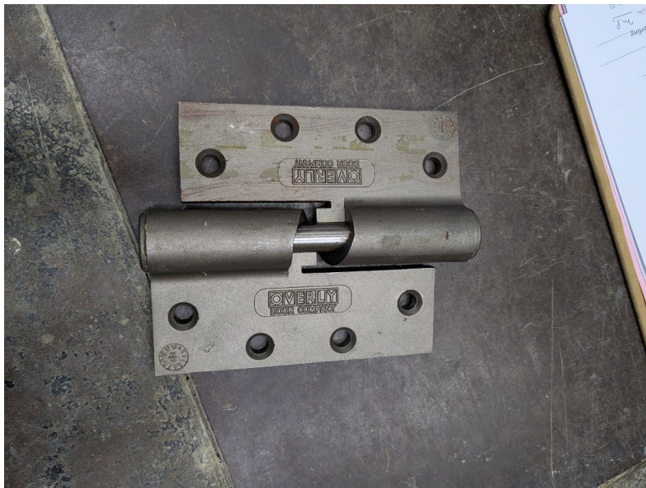
Figure 2 – Door hinge prior to installation