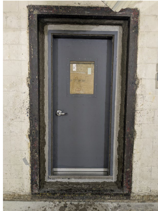
Figure 1 – Specimen mounted in test aperture, as viewed from source room (left) and receive room (right)