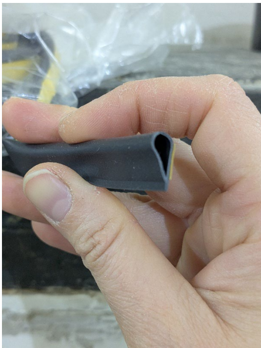
Figure 2 – Bubble gasket prior to installation