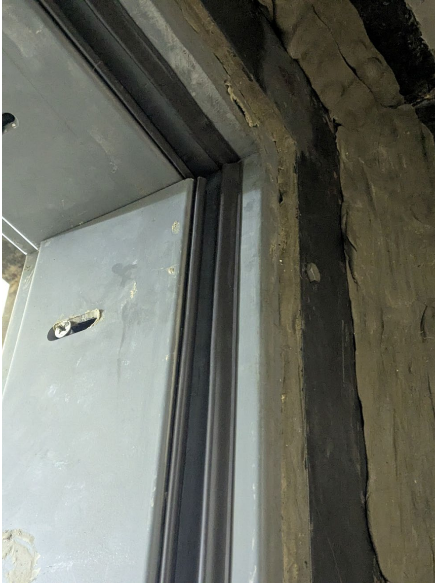
Figure 3 – Bubble gaskets installed