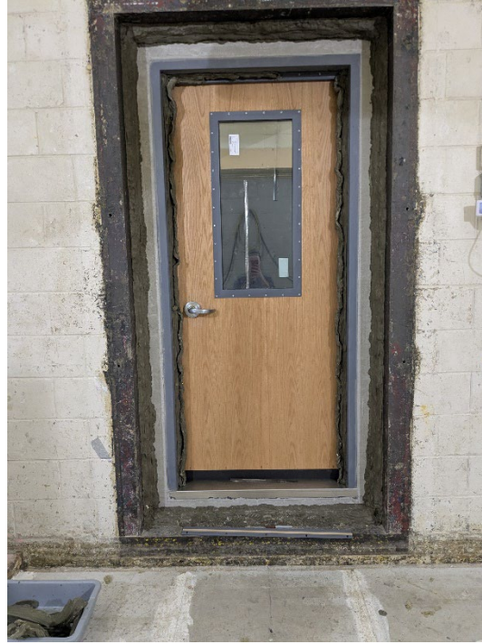
Figure 1 – Specimen mounted in test aperture, as viewed from source room (left) and receive room (right)