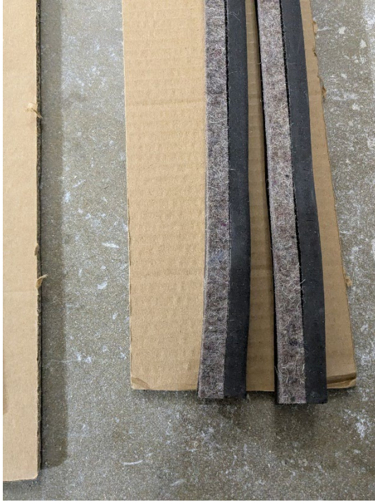
Figure 3 – Neoprene H seals prior to installation