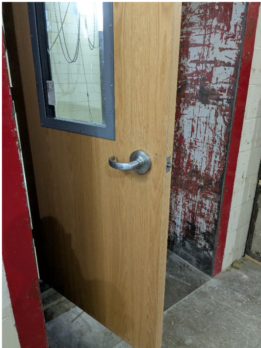
Figure 4 – Operation of door prior to test