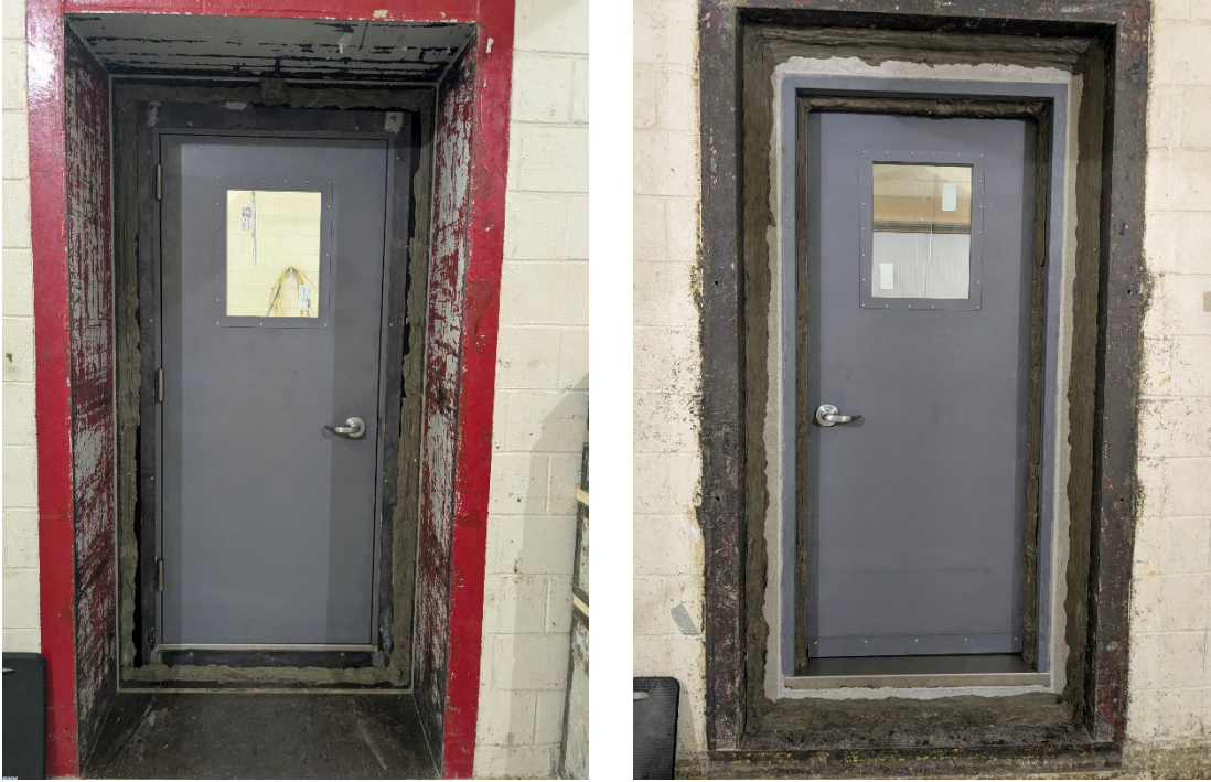
Figure 1 – Specimen mounted in test aperture, as viewed from source room (left) and receive room (right)