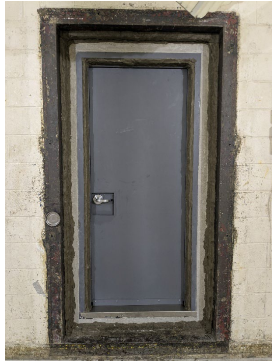
Figure 1 – Specimen mounted in test aperture, as viewed from source room (left) and receive room (right)