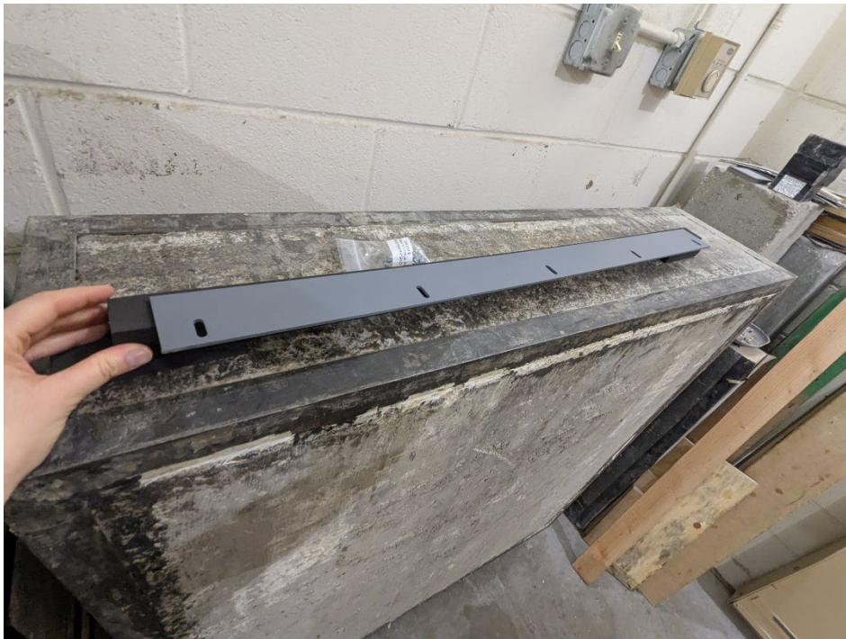
Figure 2 – Super H Door Bottom prior to installation