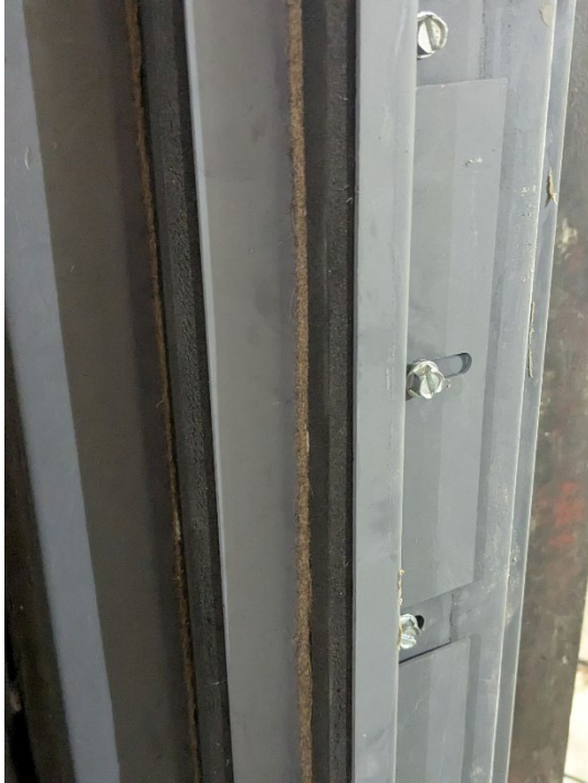
Figure 3 – Frame stops with H-Seal gaskets