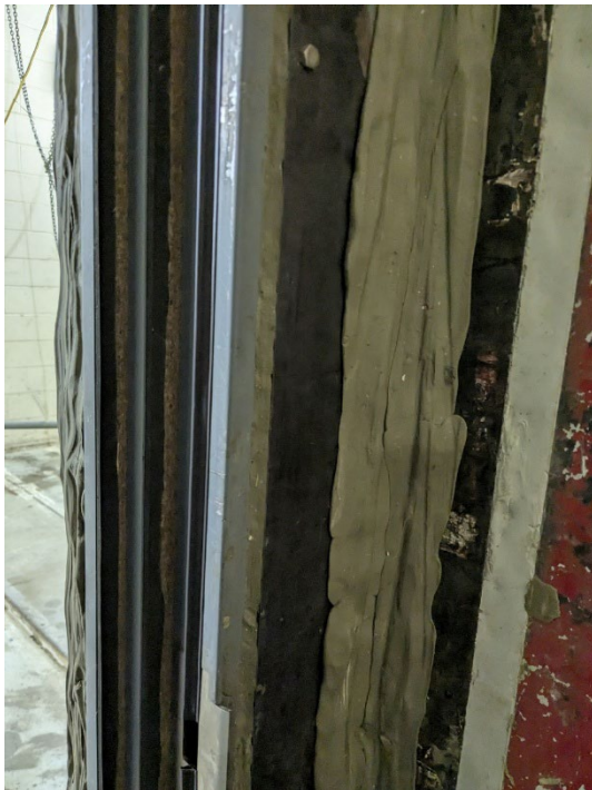
Figure 4 – Bubble gasket installed